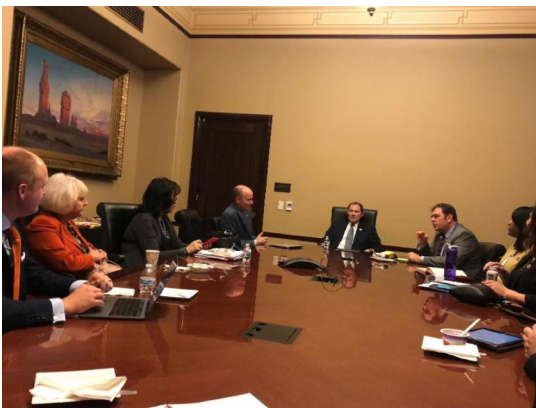
Weekly Leadership meeting with Governor Gary R. Herbert