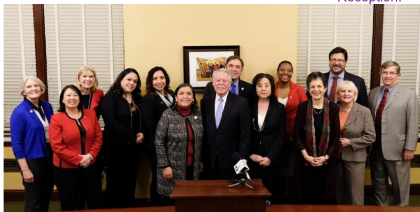
Democratic house and Senate Caucus following Governor Gary Herbert's State of the State Address