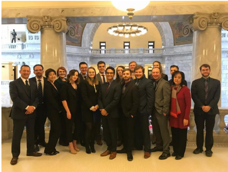
Honoring John R. Park Debate Society