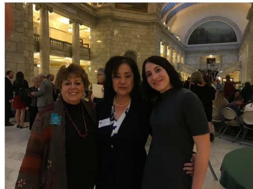
Disability is not inability! Legislative Coalition for People with Disabilities Reception.