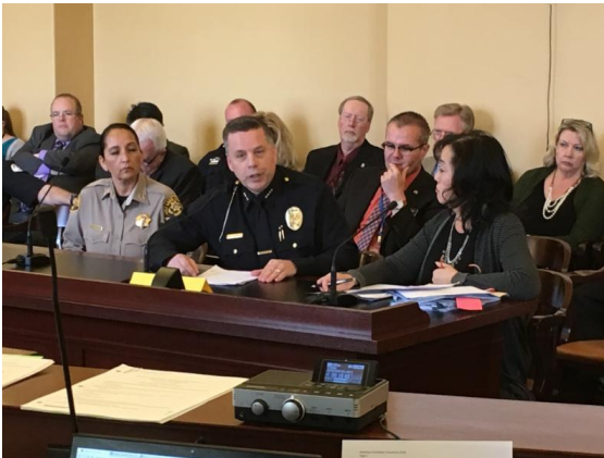
Supportive testimony on my postretirement employment legislation - SB 113

This is a "user fee" approach. If the LEAs, for example, don't want to do it, it will not cost them.