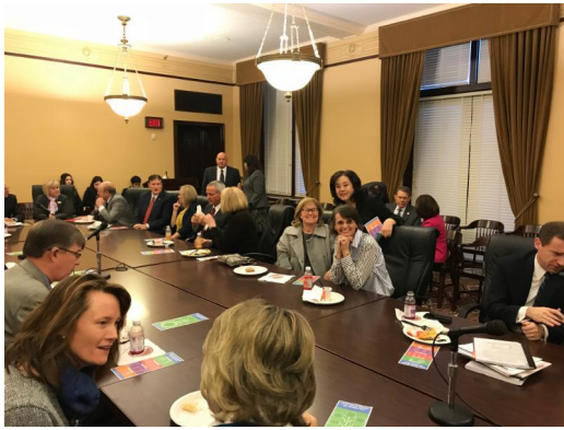
Meeting with educators at the Capitol