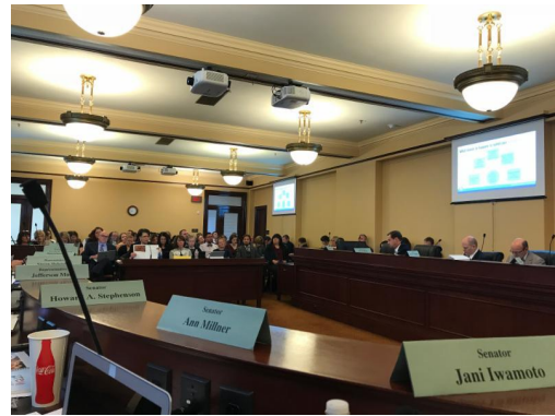
Public Education Appropriations Subcommittee